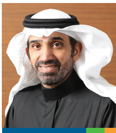
HE Eng Ahmed bin Suleiman Al Rajhi Minister of Labour and Social Development Chairman